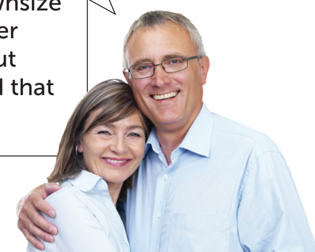
Front and Back Homes

We were overwhelmed with how big our house was once our kids all moved out. Too much space for two people. So it's been so nice to be able to downsize our lives and move into this smaller home with newer features, without having to leave our neighborhood that our kids grew up in.